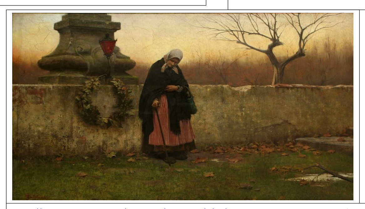
https://upload.wikimedia.org/wikipedia/commons/6/65/Jakub Schikaneder - All Souls' Day.jpg

How can we be more aware, and be actively supportive of people who are wounded or suffering in any way, in our families, and in the parish and wider community? What about people who are isolated, homeless, in prison, or living in poverty? How can we help any one of these?